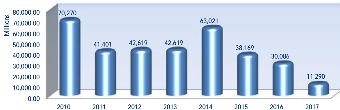
Yearly Transactions Value in mil. €