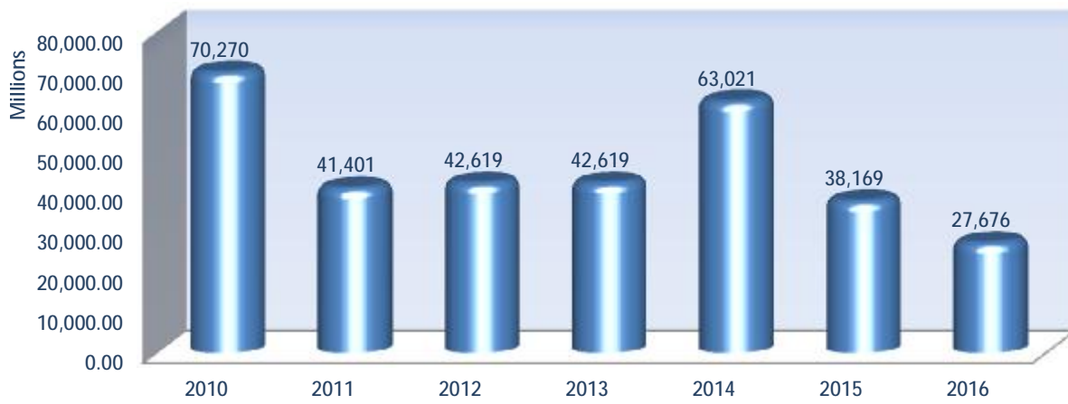
Yearly Transactions Value in mil. €