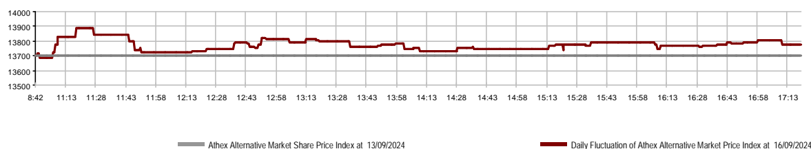
Daily Fluctuation of Athex Alternative Market Price Index