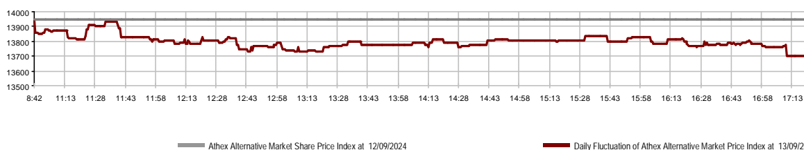
Daily Fluctuation of Athex Alternative Market Price Index