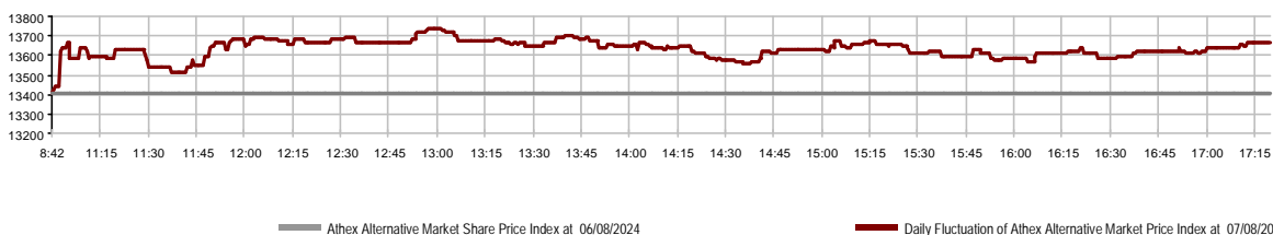
Daily Fluctuation of Athex Alternative Market Price Index