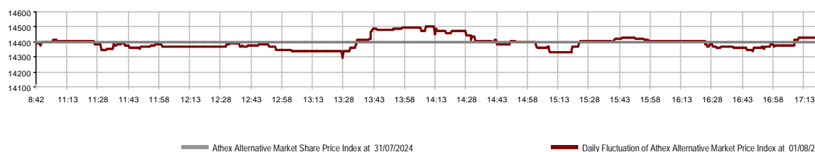
Daily Fluctuation of Athex Alternative Market Price Index