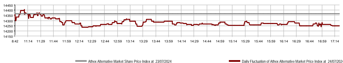
Daily Fluctuation of Athex Alternative Market Price Index