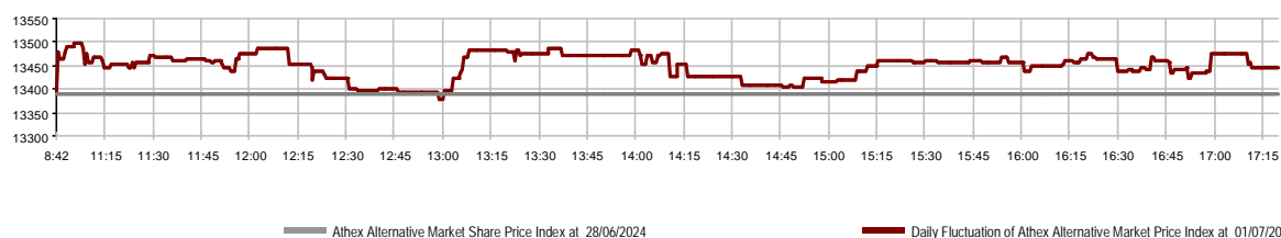
Daily Fluctuation of Athex Alternative Market Price Index