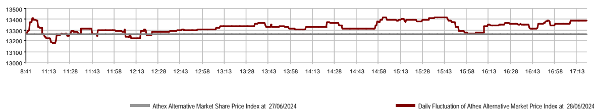
Daily Fluctuation of Athex Alternative Market Price Index