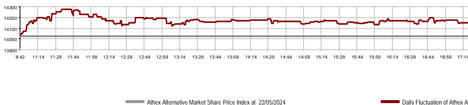
Daily Fluctuation of Athex Alternative Market Price Index