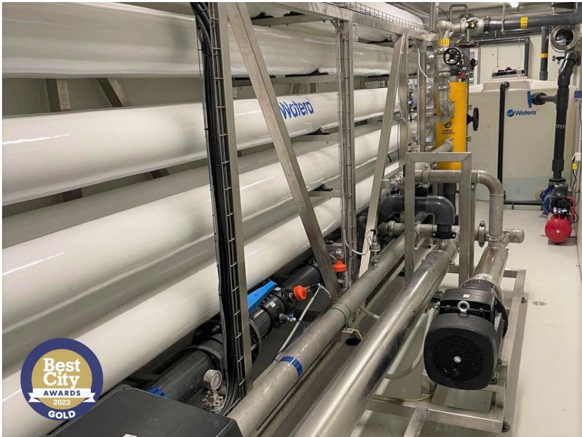
MYCONOS DESALINATION PLANT