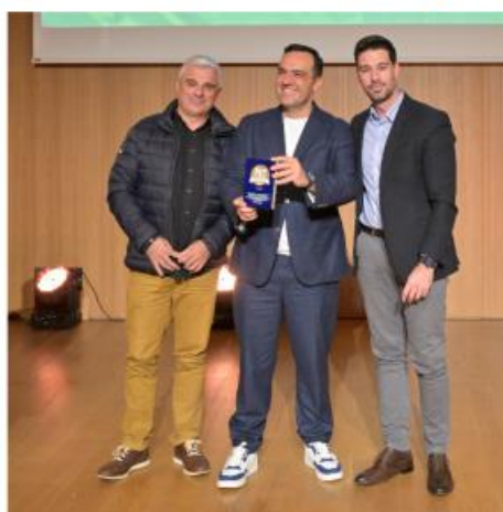
AWARD CEREMONY "BEST CITY AWARDS"