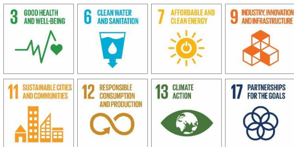
Goals associated with ICMA categories

Noval Property’s operations in relation to SDG Goal 7 “Affordable and clean energy,” Goal 9 “Industry, innovation and infrastructure,” Goal 11 “Sustainable cities and communities” and Goal 12 “Responsible consumption and production” presents the largest positive impact. Through the corporate positive impact on the aforementioned goals, Noval Property’s operations also contribute to Goal 13, “Climate Action”.